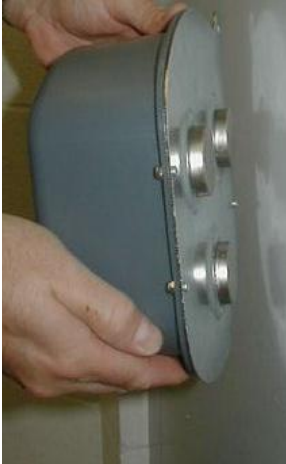
Figure 1: Correct Way to Hold Tail Light

WARNING! While the magnetic mount should hold the Tail Lights in place under normal use, certain conditions may cause the Tail Lights to dislodge. YOU MUST TETHER EACH TAIL LIGHT TO YOUR VEHICLE TO PREVENT IT FROM FALLING OFF YOUR VEHICLE IF IT BECOMES DISLODGED.