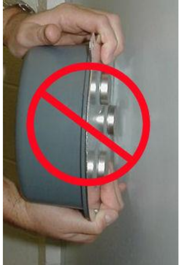
Figure 2: Incorrect Way to Hold Tail Light