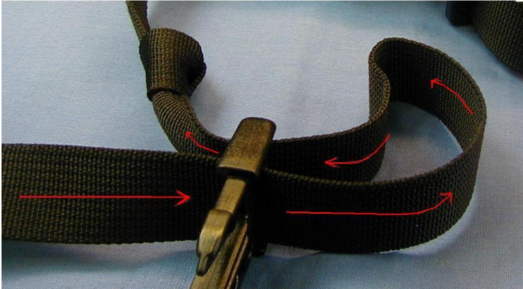
Figure 4: Tether Strap Routing Through Clip